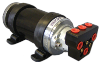
Octopus Piston Pump